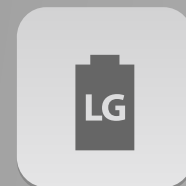
Premium LG Battery Cell