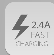
Ultra Fast Charging and Recharging Speed