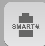
TP-LINK Smart Charging