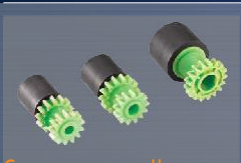
Conveyance rollers (PA-RL-001, PA-RL-002 & PA-RL-003) Ensures tubes move smoothly through the machine.