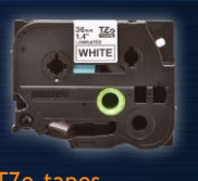
TZe tapes Suitable for both office and industrial use, our TZe standard laminated tapes are weatherproof, waterproof and resistant to wear and tear.