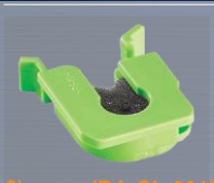
Cleaner (PA-CL-001) Cleans the tube to ensure surface is dirt-free before printing.