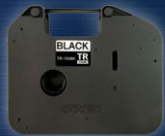
Ink ribbon (TR-100BK) 100m black ink ribbon used for tube printing.